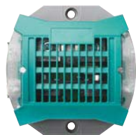
MasterShunt Part No. M77020100