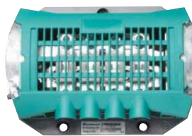
DC Distribution 500 Part No. M77020200