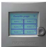
MasterView Easy Part No. M77010305