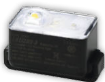
72349 LALIZAS Lifejacket LED Flashing light "Safelite IV" ON-OFF water activated, USCG, SOLAS/MED