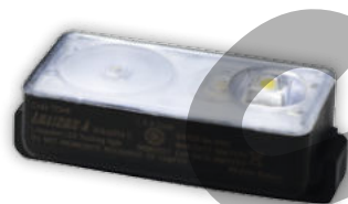
72348 LALIZAS Lifejacket LED flashing light "Alkalite II" ON-OFF water activated, L.S.A. Code